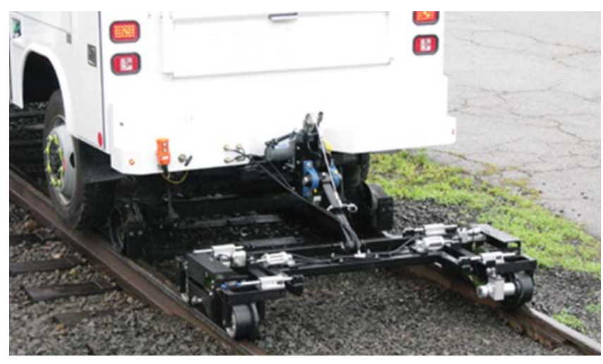
Flex - Hitch-Mounted Inspection Carriage

Complete rail inspection services, on your schedule, when you need them.