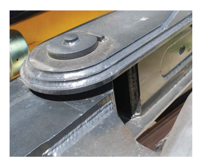
Breakaway boom joint protects boom by rotating backward when encountering an immoveable object.

Set the quick stop controls to allow immediate brake stops when necessary.