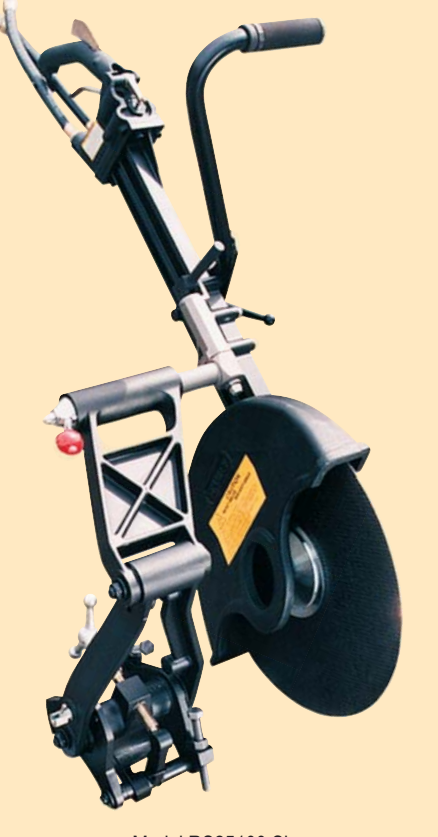
Model RS25100 Shown